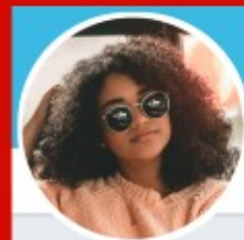
Angela Leader @Angelala FOLLOWS YOU

Forms of electronic communication through which users create online communities to share information, ideas, personal messages, and other content.